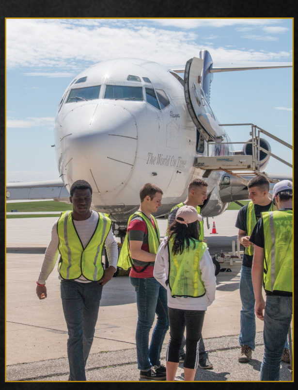
A production of Purdue Research Foundation Marketing and Communications